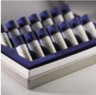
ARTISTRY® TIME DEFIANCE® Intensive Repair Serum ★P7270B19920Y16600 10-0282 224.10

REVERSE THE SIGNS OF AGING IN JUST 14 NIGHTS