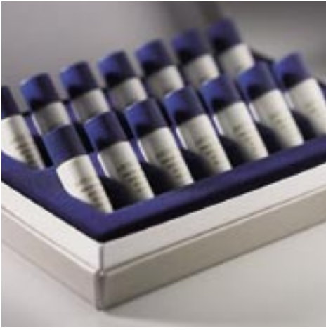
ARTISTRY® TIME DEFIANCE® Intensive Repair Serum ★P7270B19920Y16600 10-0282 224.10